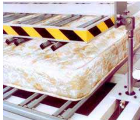
Can accommodate deep mattresses